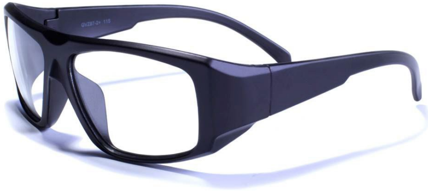
IROP 11 - $15.00 58-17-115 Black – Clear