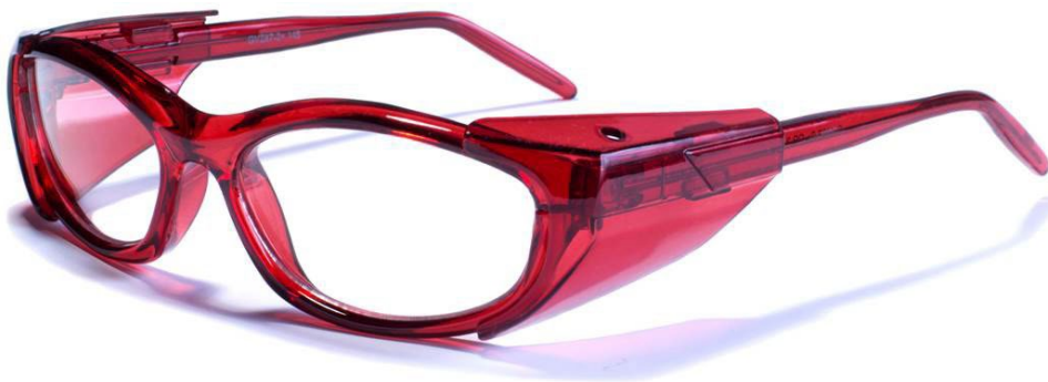
OP 3 - $15.00 55-23-145 Crystal Burgundy