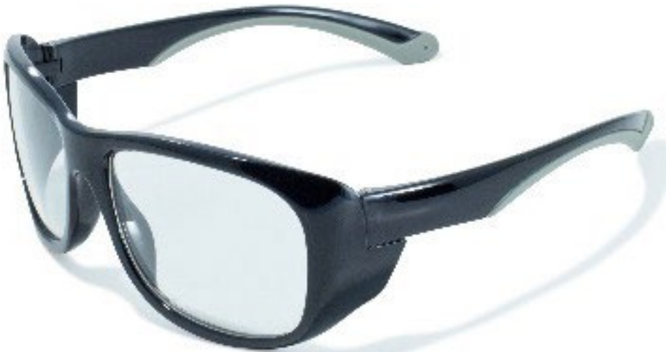
OP 13 - $15.00 58-18-135 Black