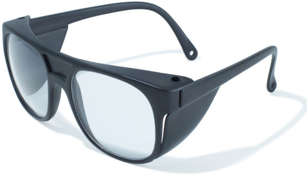
PS322 - $15.00 55-25-130 Black