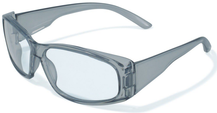
RX-G - $15.00 60-14-130 Black - Crystal Dark Gray – Demi