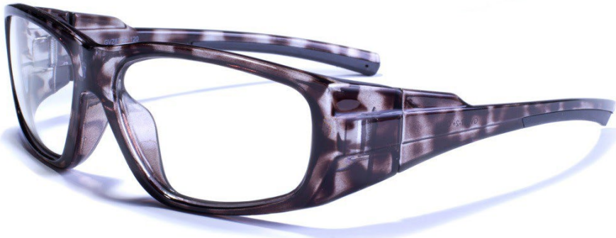
OP 12 - $15.00 58-18-120 Demi Gray