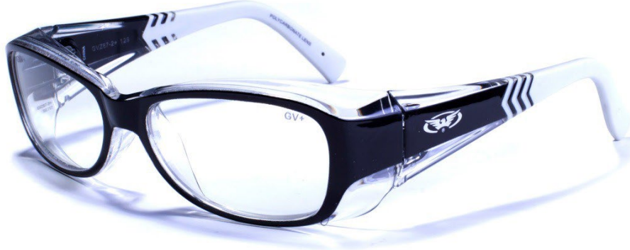
RX-E - $15.00 54-17-135 Black