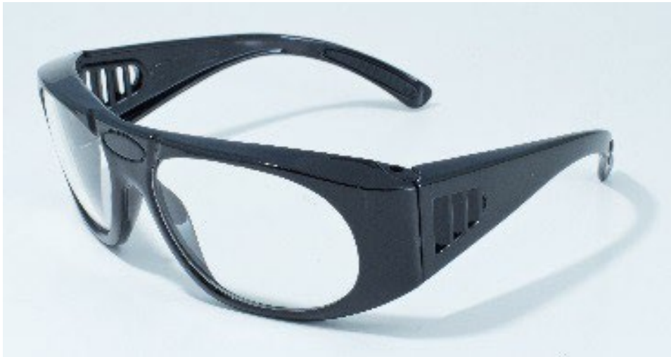
PS323 - $15.00 57-18-127 Black