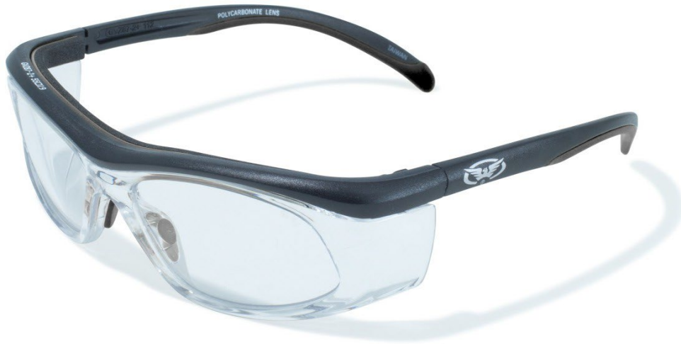
RX-A - $15.00 55-19-120 Black Upper/Clear Lower