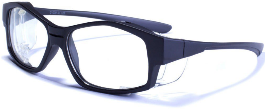
OP 7 - $15.00 55-21-128 Black