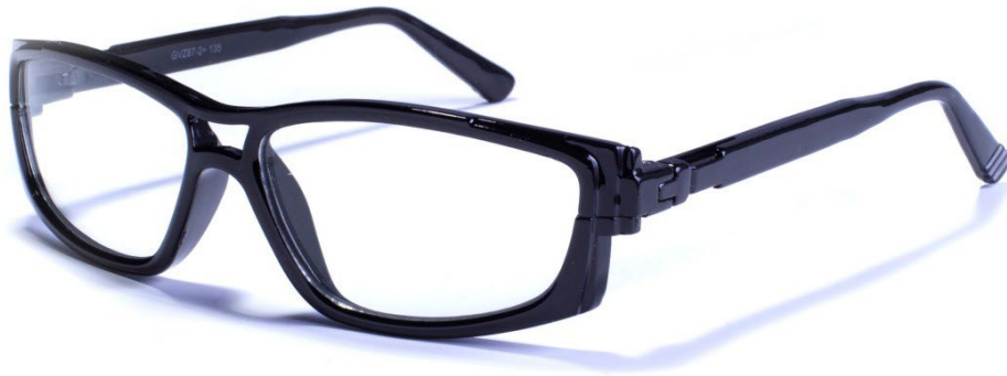
OP 1 - $15.00 58-20-135 Black